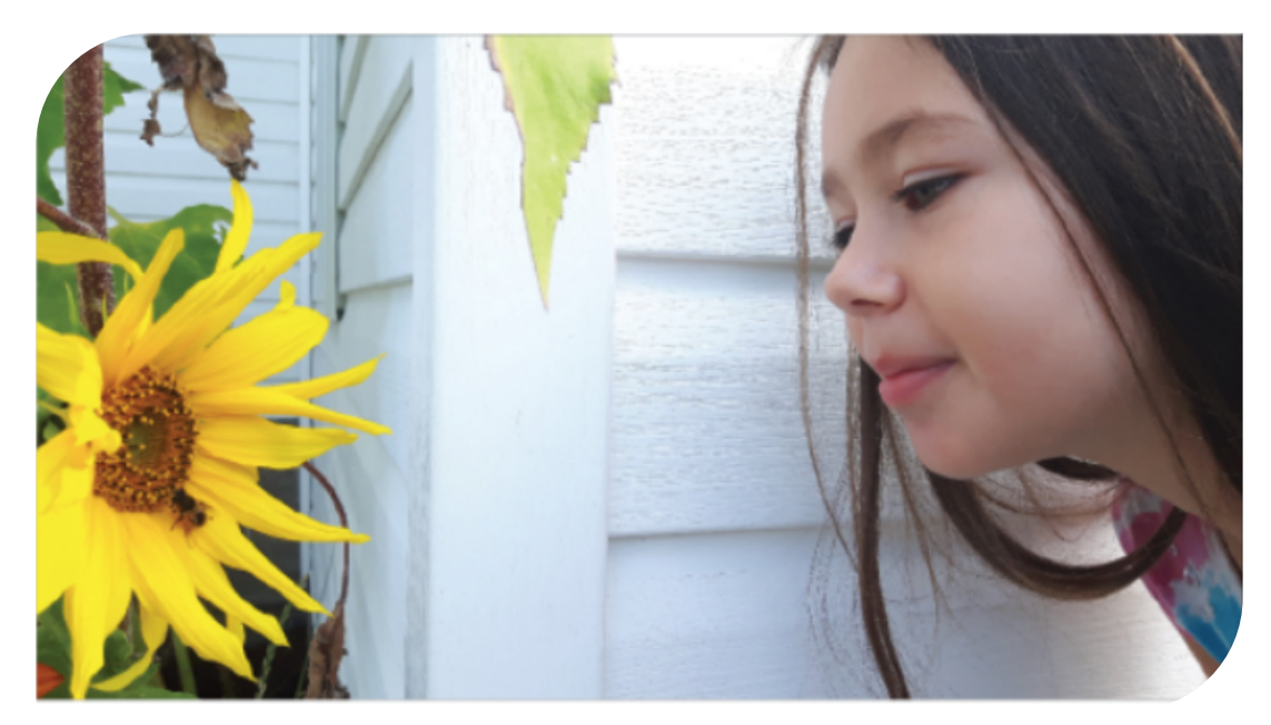
Your gift to Kids in the Biosphere would enhance the impact of our education programs to children in local communities and those who cottage on the Bay.

Since 2010, we have offered quality education programs and resources year-round that are designed to foster ecological literacy. Our activities for youth are directly related to the ecology, geology, species, culture and history of the Bay.